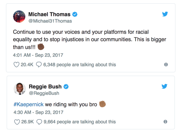
Figure 1: Recent tweets using the dark fist emoji (dark skin color in the first and medium-dark in the second).

Moreover, we encountered other interesting findings related to the usage of emojis with respect to gender and skin tones. For instance, our analysis revealed that light skin tones are more widely used than dark ones and their usage is different in many cases. However, incidentally the dark raised fist emoji (i.e. ) is significantly more used, proportionally, than its lighter counterparts. This is mainly due to the protest black community started in favour of human rights, dating back from the Olympic Games of Mexico 1968. This sign was known as the Black Power salute (Osmond, 2010) and is still widely used nowadays, especially in social media symbolized by the above-mentioned dark-tone fist emoji. Figure 1 shows two recent tweets using this emoji as a response to some Donald Trump critics to NFL players protesting for black civil rights by kneeing during the national anthem before their games. As far as gender-based features are concerned, female modifiers appear much closer to emojis related to love and makeup, while the male ones are closer to business or technology items.